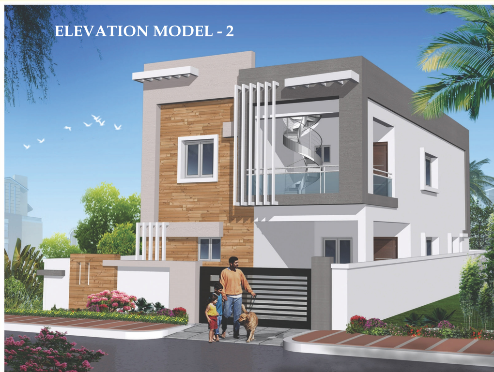
ELEVATION MODEL - 2