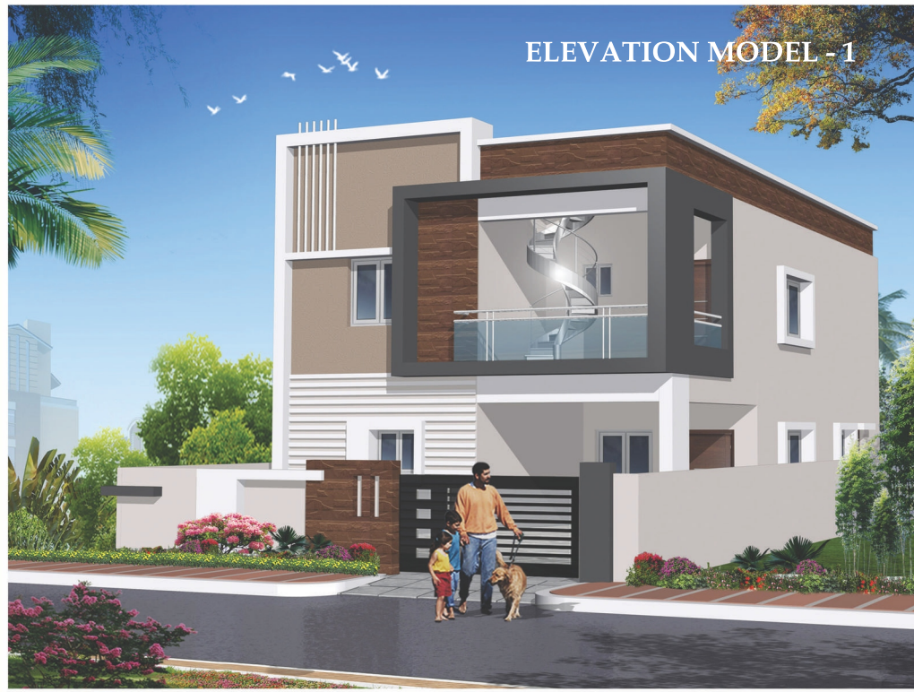
ELEVATION MODEL - 1